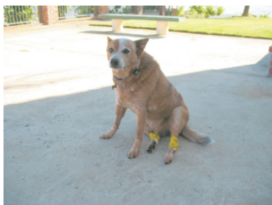
Petie "our winery dog" diagnosed 2007

July 19th 2008 Oak Mountain Winery 3:00-7:00pm